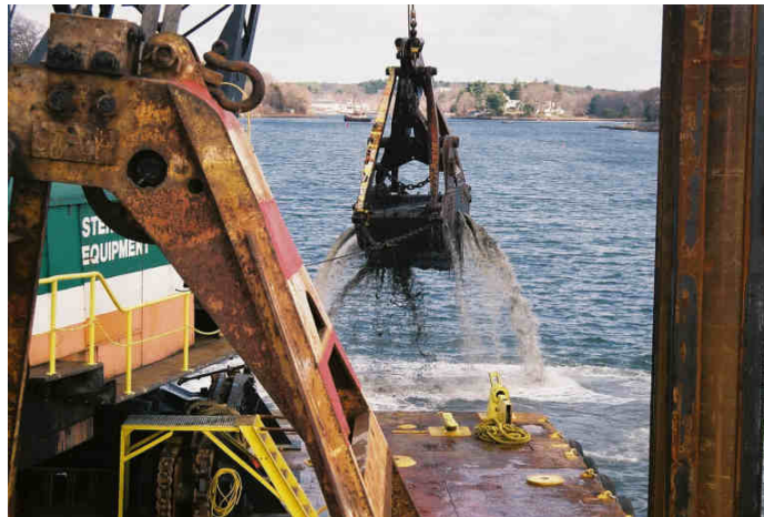
Clamshell dredge in the channel (Photo 2)

The dredging project was completed in the winter of 2001 by the contractor Jay Cashman, Inc. utilizing an eight (8) yard clamshell dredge and a 2000 cy dump scow (see Photo 2) with offshore disposal. The dredge area was limited to only specific areas and no dredging of the channel side-slopes. Additional restrictions included a no-spud zone within 25' of the buried sewer outfall line. The specifications also include the contractor to use a DGPS system with HYPACK software to provide positioning for the dredge and log dredge production activities. The contractor completed the work ahead of schedule and was very diligent in abiding by the permit conditions for the project.