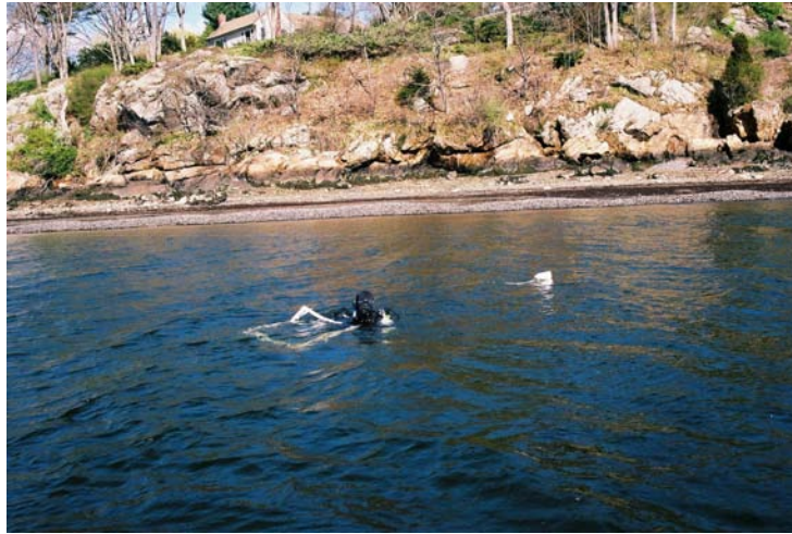
Diver Performing Eelgrass Inspection at Buoyed Location (Photo 3)

The results for a 2002, 2003 and 2004 eelgrass studies performed by CLE are as follows: